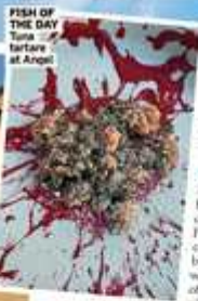
FISH OF THE DAY Tartare at Angel