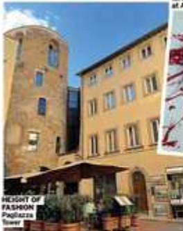
HEIGHT OF FASHION Palazzo Tower

class) in the Tuscan city, no longer visit. But it's still possible to visit visitors on a short tour with Claudia Duranti.