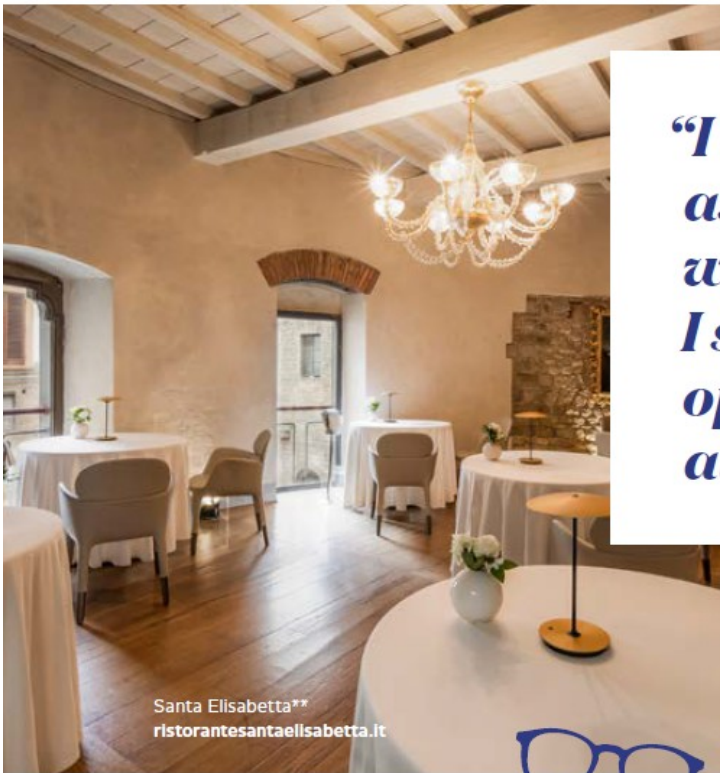
Santa Elisabetta** ristorantesantaelisabetta.it

“I see my journey as a chef as a work in progress. I seize every opportunity along the way.”